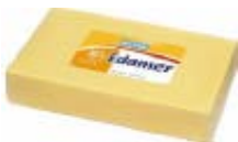
Milram Edamer light block-cheese 30 % idm 15,5 Kg item: 61920-1