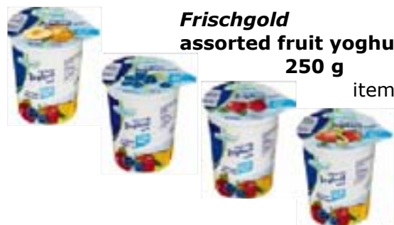
Frischgold assorted fruit yoghurts 250 g