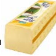
Milram semi-hard cream cheese 55 % idm 3,2 Kg item: 61935-5