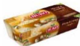
Buko Funghi cream cheese for microwave 2x100 g item: 66037-1