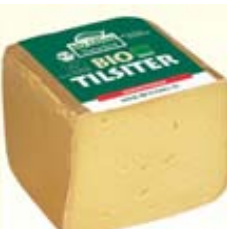
Bio Greno semi-hard Tilsiter cheese