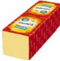
Milram semi-hard Edamer cheese 40 % idm 3 Kg item: 61820-4