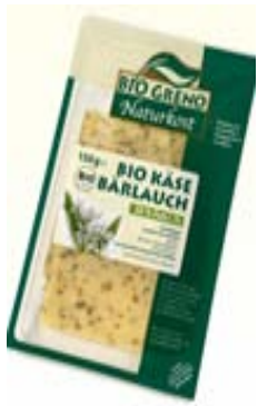
Bio Greno semi-hard cheese slices with bear's garlic