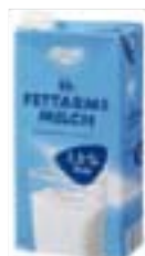
Frischgold durable low-fat milk 1,5 % fat pasteurised 1 L item: 13587-9