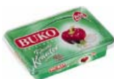
Buko cream cheese with piquant herbs 70 % idm 200 g item: 66005-0