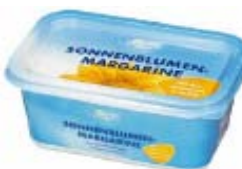
Frischgold sunflower margarine