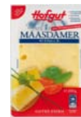
Hofgut Maasdamer cheese slices 45% idm 200 g item: 65523-0