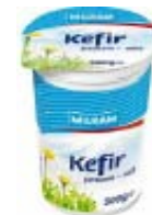
Milram low-idm kefir 1,5% idm 500 g item: 16010-9