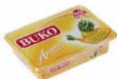
Buko cream cheese with pineapple 70% idm 200 g item: 66010-4