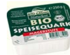
Bio Greno low fat curd