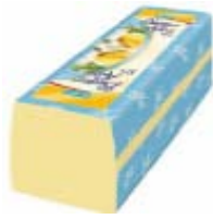
Milram semi-hard butter cheese 45 % idm 3,1 Kg item: 61915-7