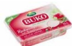
Buko season cream cheese with radish 15 % idm 200 g item: 66023-4