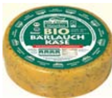
Bio Greno semi-hard cheese with bear's garlic