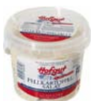
Hofgut potato salad