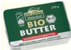
Bio Greno butter