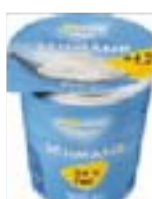
Frischgold sour cream 24 % fat 200 g item: 19230-8