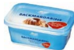
Frischgold baking margarine