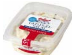
Hofgut poultry salad