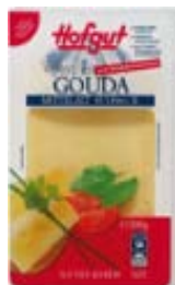
Hofgut Gouda middle-aged cheese slices 45% idm 200 g item: 65521-6