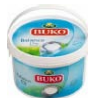
Buko Balance cream cheese 17% idm 1500 g item: 66470-6