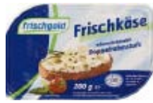
Frischgold double cream cheese