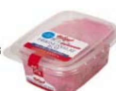
Hofgut herring salad in beet dressing