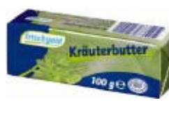
Frischgold butter with herbs