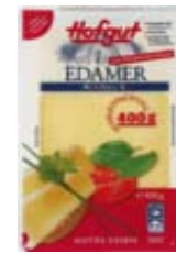
Hofgut Edamer cheese slices 40% idm 400 g item: 65518-6