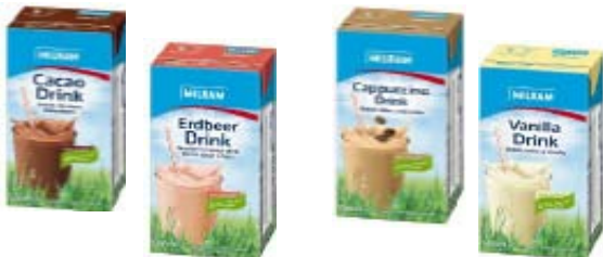
Milram assorted long-life milk-drinks 0,1%-0,3% idm cacao, strawberry, cappuccino, vanilla 500 ml item: 07401-7