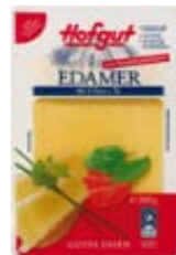
Hofgut Edamer cheese slices 40% idm 200 g item: 65512-4