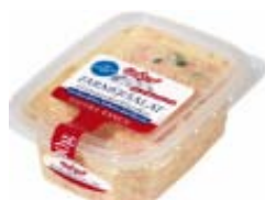
Hofgut farmer salad gluten free