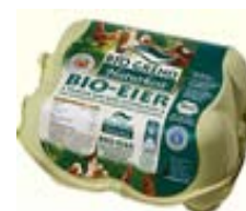
Bio Greno eggs size M/L 6- pack