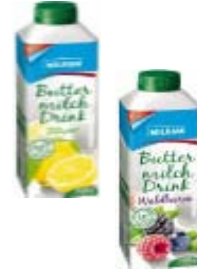
Milram fruit butter-milk drinks 750 g lemon item: 07297-6 forest berries item: 07307-2