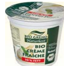
Bio Greno creme fraiche