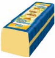
Milram Benjamin Gouda semi-hard cheese 48 % idm 3,2 Kg item: 61900-3