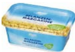
Frischgold vegetable margarine