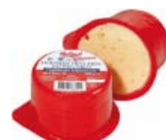
Hofgut creamy-mild semi-hard cheese 60 %