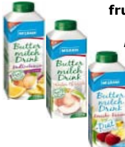
Milram fruit butter-milk drinks 750 g multivitamine item: 07299-0 white peach 07298-3 diet cherry- banana item: 07311-9