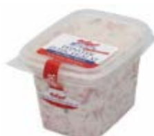
Hofgut meat salad gluten & lactose free