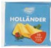
Frischgold Holland soft cheese slices