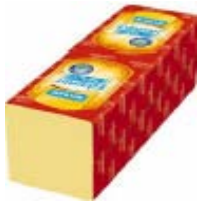
Milram semi-hard cream cheese 55 % idm 3,2 Kg item: 61825-9