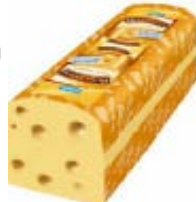
Milram Burlander semi-hard light cheese 30 % idm 3,1 Kg item: 61945-4