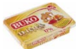
Buko India cream cheese 17 % idm 200 g item: 66028-9