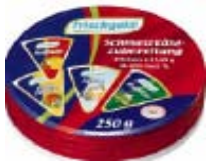
Frischgold assorted soft cheese