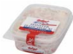
Hofgut meat salad gluten & lactose free