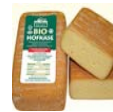
Bio Greno semi-hard farm cheese