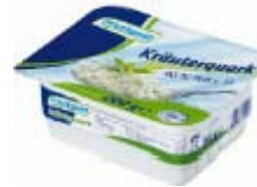
Frischgold herb curd