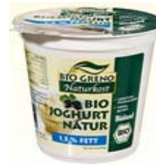
Bio Greno natural yoghurt