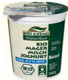
Bio Greno low-fat yoghurt