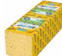
Milram Mueritzer semi-hard cheese 55 % idm 3 Kg item: 61936-2