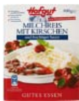
Hofgut cherry rice pudding 400 g