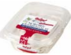
Hofgut crabs salad with 45 % crabs