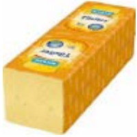
Milram semi-hard Tilsiter cheese 45 % idm 3,3 Kg item: 61970-6