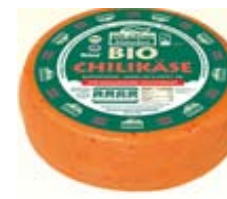
Bio Greno semi-hard cheese with Chili pepper