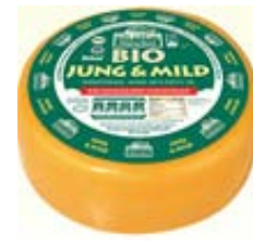
Bio Greno semi-hard fine spicy mild cheese