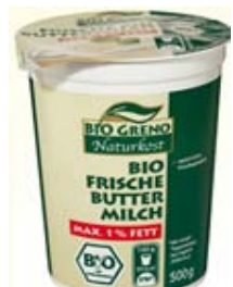
Bio Greno buttermilk