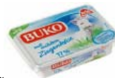
Buko goat cream cheese 17 % idm 200 g item: 66004-3