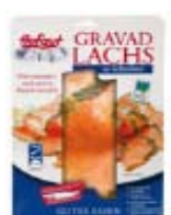
Hofgut gravlax salmon