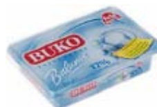
Buko balance cream cheese 17 % idm 200 g item: 66015-9