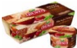
Buko Bruchetta cream cheese for microwave 2x100 g item: 66034-0