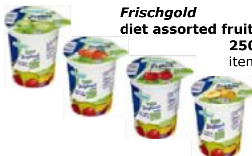
Frischgold diet assorted fruit yoghurts 250 g