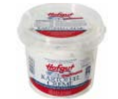
Hofgut potato-cream salad