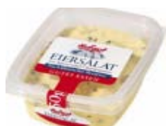
Hofgut egg salad