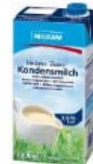
Milram condensed milk heat-treated 7,5% idm 1 L item: 01532-4