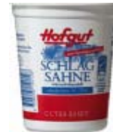
Hofgut whipped cream min. 30% fat 200 g item: 01401-3