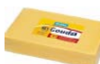
Milram Gouda block-cheese 40 % idm 15,5 Kg item: 61925-6