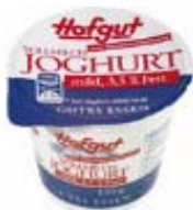
Hofgut whole milk yoghurt 3,5% fat 150 g item: 01302-3