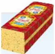
Milram Tomato-basil semi-hard cheese 50 % idm 3,1 Kg item: 61902-7