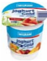
Milram strawberry fruit yoghurt 150 g item: 07468-0