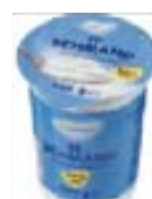
Frischgold long-life sour cream 24 % fat 200 g item: 07510-6