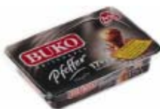
Buko cream cheese with pepper 17 % idm 200 g item: 66395-2