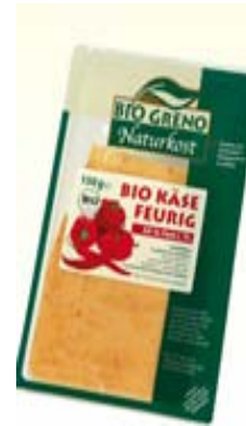
Bio Greno semi-hard cheese slices with cayenne pepper