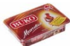
Buko cream cheese with horse radish 70 % idm 200 g item: 66006-7