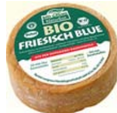
Bio Greno semi-hard Frisian blue cheese