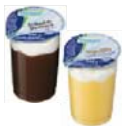
Frischgold desserts with whipped cream chocolate 200 g item: 19210-0 vanilla 200 g item: 03155-3