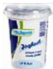
Frischgold low-fat yoghurt 1,5 % fat 500 g item: 16015-4