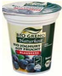
Bio Greno fruit yoghurt with blueberry