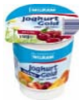
Milram cherry fruit yoghurt 150 g item: 07467-3