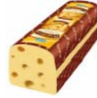
Milram Burlander semi-hard cheese 45 % idm 3,1 Kg item: 61910-2