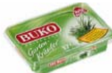
Buko cream cheese with garden herbs 17 % idm 200 g item: 66016-6