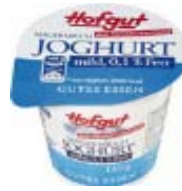
Hofgut low-fat milk yoghurt 0,1% fat 150 g item: 01303-0