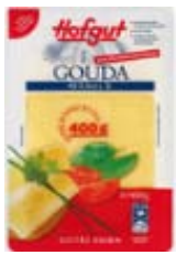
Hofgut Gouda cheese slices 48% idm 400 g item: 65516-2