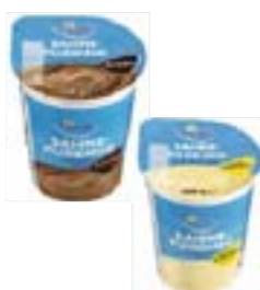
Frischgold chocolate cream pudding 200 g item: 19205-6 vanilla cream pudding 200 g item: 19201-8