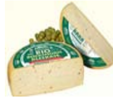
Bio Greno semi-hard fenugreek cheese