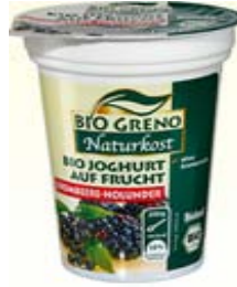
Bio Greno fruit yoghurt with elder & blueberry