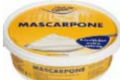
Monte Castello mascarpone cream cheese