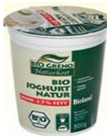
Bio Greno natural yoghurt