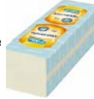
Milram semi-hard Mozzarella cheese 40 % idm 3 Kg item: 61815-0