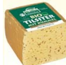
Bio Greno semi-hard Tilsiter cheese with caraway seeds