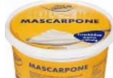
Monte Castello mascarpone cream cheese