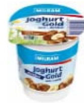
Milram nut-caramel fruit yoghurt 150 g item: 07473-4