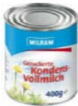
Milram sweetened condensed milk 9% idm 400 g item: 07161-0