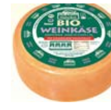
Bio Greno semi-hard wine cheese