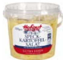
Hofgut salad with potatoes & bacon