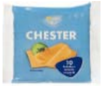
Frischgold Chester soft cheese slices