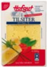
Hofgut Tilsiter cheese slices 45% idm 200 g item: 65511-7