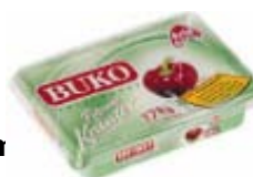
Buko light cream cheese with piquant herbs 17 % idm, 200 g item: 66020-3