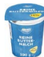
Frischgold butter-milk max. 1 % fat 500 g item: 19205-6