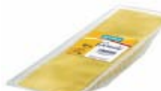
Milram Gouda cheese slices 48% idm 1 Kg item: 61814-3