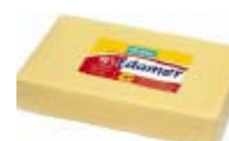
Milram Edamer block-cheese 40 % idm 15,5 Kg item: 61955-3