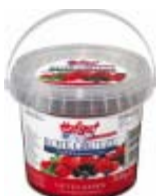
Hofgut red fruit jelly 50% fruits