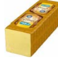
Milram semi-hard smoked cheese 45 % idm 3 Kg item: 61995-9