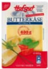
Hofgut butter cheese cheese slices 45% idm 400 g item: 65517-9