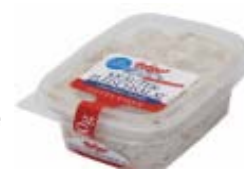
Hofgut meat salad with herbs gluten & lactose free