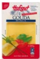
Hofgut Gouda cheese slices 48% idm 200 g item: 65513-1