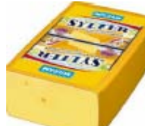
Milram North Frisian Sylter semi- hard cheese 48 % idm 3,75 Kg item: 61938-6