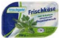
Frischgold double cream cheese with herbs