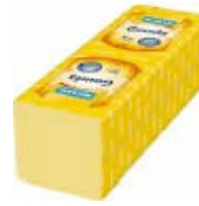
Milram semi-hard Gouda cheese 45 % idm 3 Kg item: 61965-2