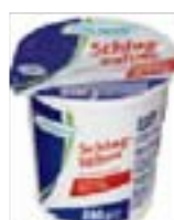
Frischgold whipping cream heat-treated min. 30 % fat 200 g item: 19206-3