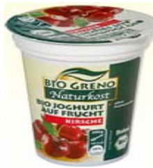
Bio Greno fruit yoghurt with cherry