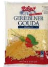
Hofgut Gouda middle-aged grated cheese 45% idm 500 g item: 65522-3