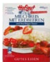
Hofgut strawberry rice pudding 400 g