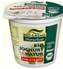
Bio Greno natural yoghurt