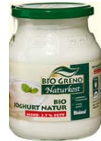
Bio Greno mild yoghurt