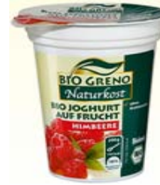
Bio Greno fruit yoghurt with raspberry