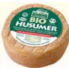
Bio Greno semi-hard Husumer cheese