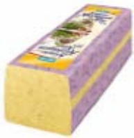
Milram semi-hard herb-garlic cheese 50 % idm 3,2 Kg item: 61905-8