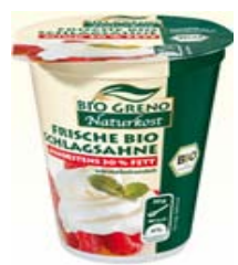
Bio Greno whip cream