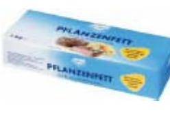
Frischgold vegetable fat