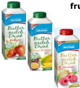
Milram fruit butter-milk drinks 750 g strawberry item: 07296-9 peach- passion fruit item: 07294-5 raspberry item: 07312-6