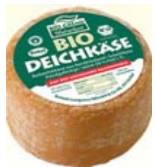
Bio Greno semi-hard cheese