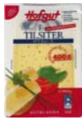
Hofgut Tilsiter cheese slices 45% idm 400 g item: 65519-3