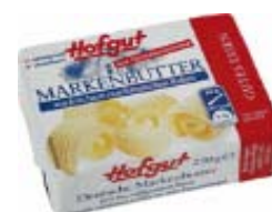
Hofgut butter 82% fat 250 g item: 15254-8