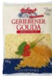
Hofgut Gouda lactose-free grated cheese 45% idm 500 g item: 65524-7