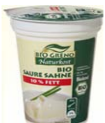
Bio Greno sour cream