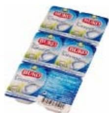
Buko cream cheese multipack classic 6x20 g item:66086-9