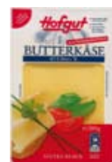
Hofgut butter cheese cheese slices 45% idm 200 g item: 65514-8