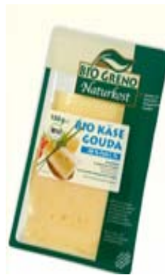
Bio Greno Gouda semi-hard cheese slices