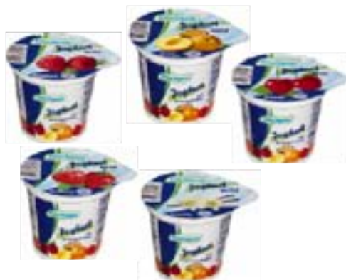
Frischgold assorted fruit yoghurts