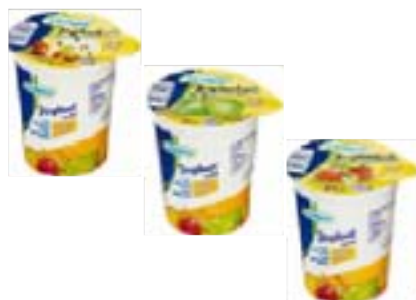
Frischgold assorted fruit yoghurts with cereals