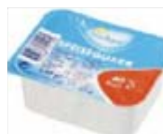
Frischgold table curd 40 % fat 250 g item: 01361-0