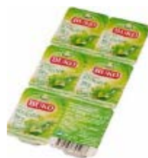
Buko cream cheese multipack with herbs 6x20 g item: 66087-6