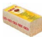
Buko soft cheese- block piquant 1,8 Kg item: 66345-7