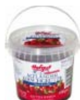
Hofgut red fruit jelly gluten & lactose free, 60% fruits