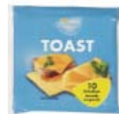
Frischgold Toast soft cheese slices