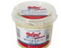
Hofgut green cabbage salad