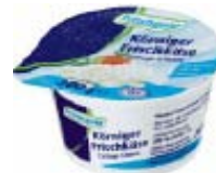
Frischgold chunky cream cheese