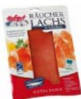
Hofgut smoked salmon